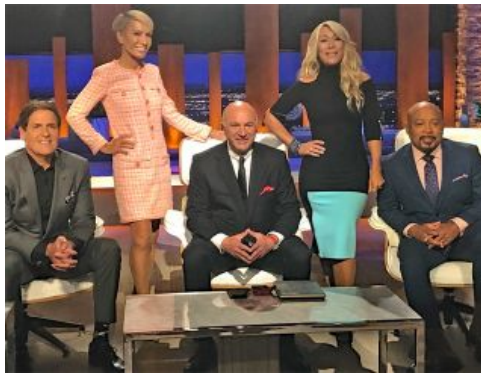
The Sharks — Mark Cuban, Barbara Corcoran, Kevin O’Leary, Lori Greiner and Daymond John — on the set of their show that debuted in 2009.